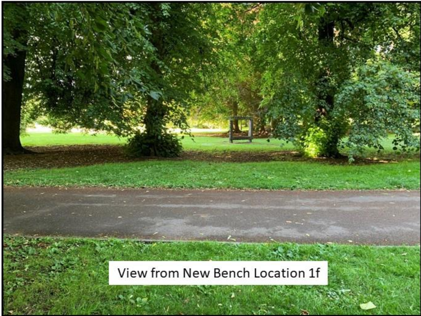
View from New Bench Location 1f